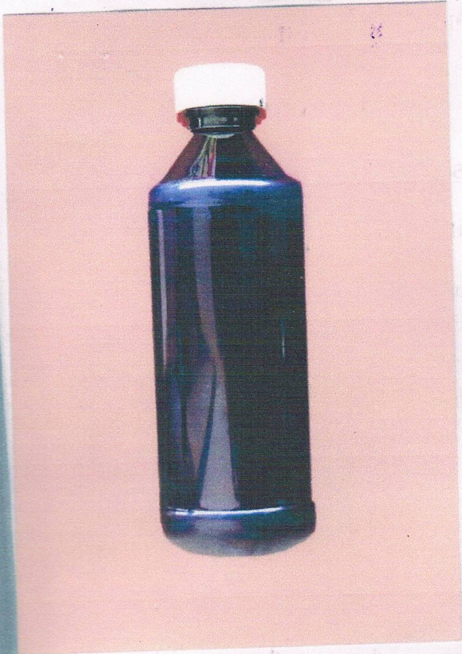
(FRONT VIEW) (BACK VIEW CORROSPONDENCE)